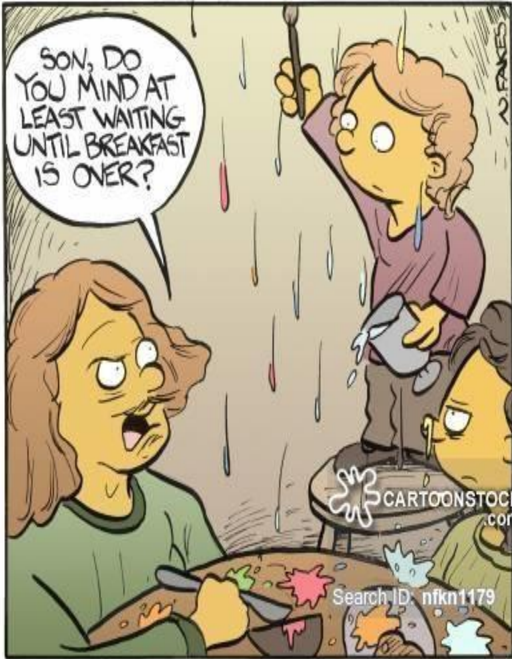
Michelangelo painting with watercolors as a child.