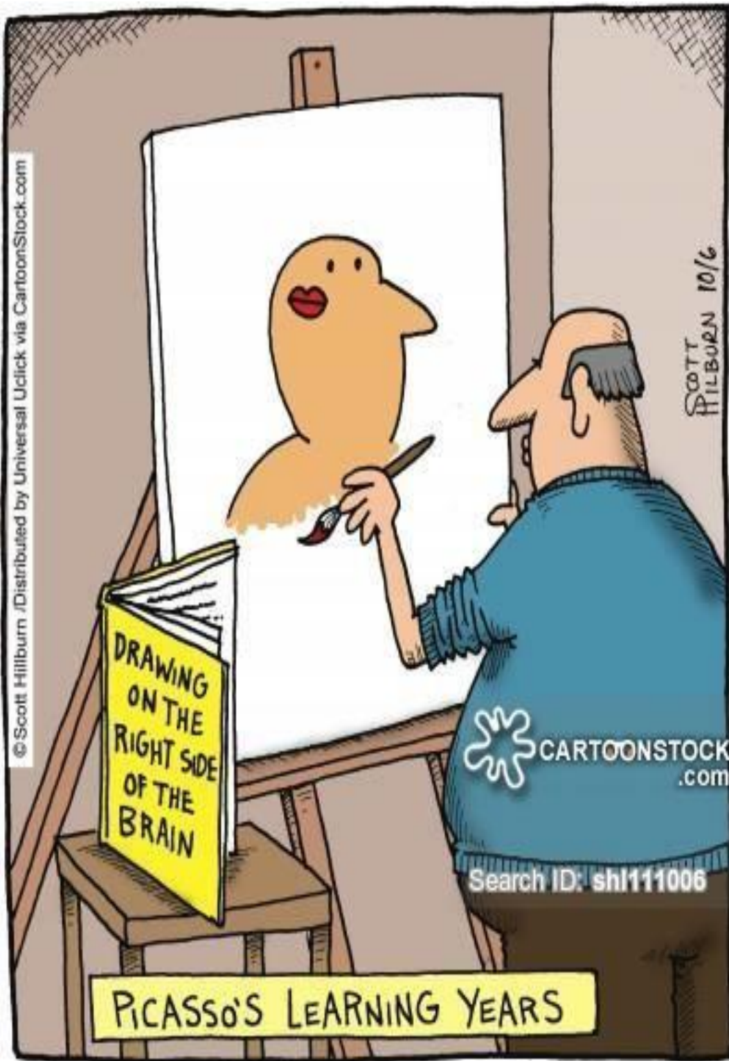
PICASSO'S LEARNING YEARS